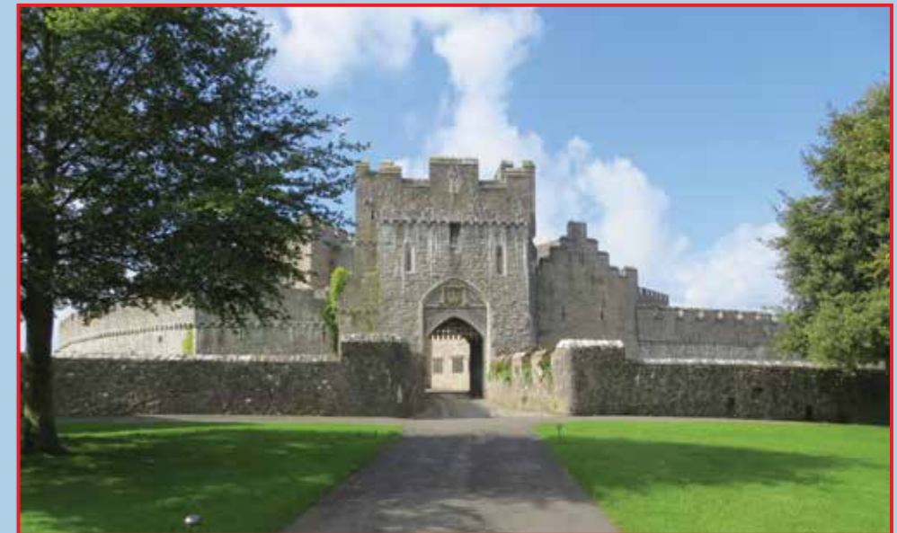
St Donat's Castle – UWC Atlantic