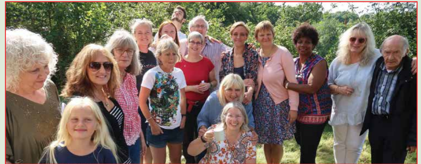
Pestalozzi staff on the last day at the Village

preparations and washing up, Housekeeping for keeping things fresh in spite of the occasional room that looked like chaos, and last but not least the Grounds staff who dealt with everything from a temperamental tractor to drains, boilers to water leaks. THANK YOU! You are the unsung heroes, with whom Village life would not have been the same.