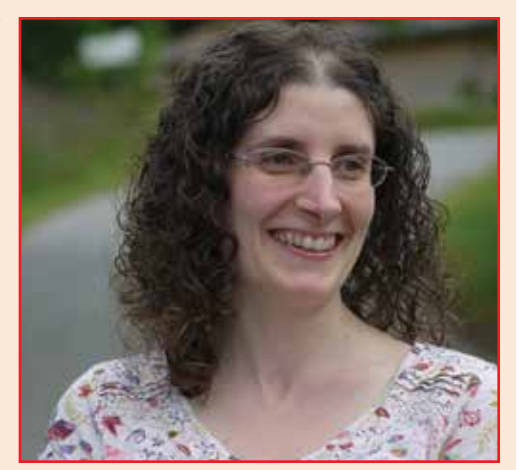
gifts in Wills. It is really inspiring working with so many people who give generously to Pestalozzi and seeing the difference they make in the lives of our students.

So far, I have been revamping some of our donor programmes including the Pestalozzi 200, for which I organised a thank you event in the spring. I've also been busy working on a programme to encourage