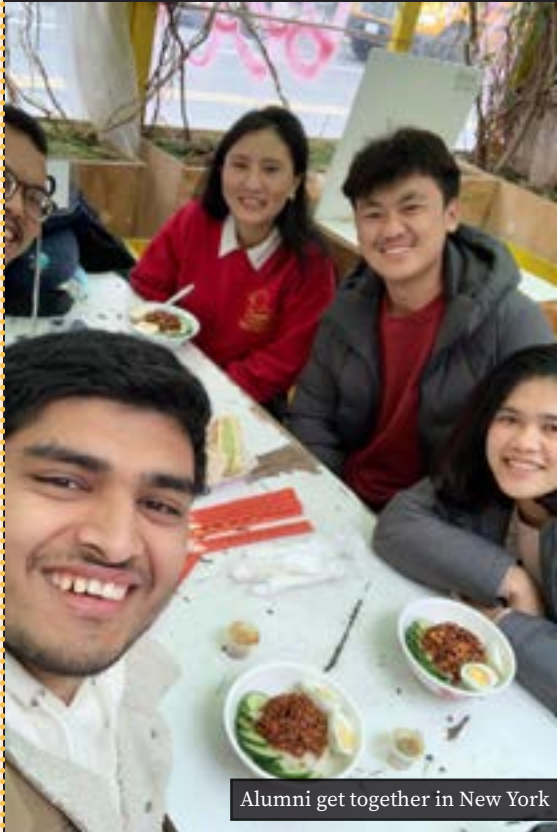
Alumni get together in New York