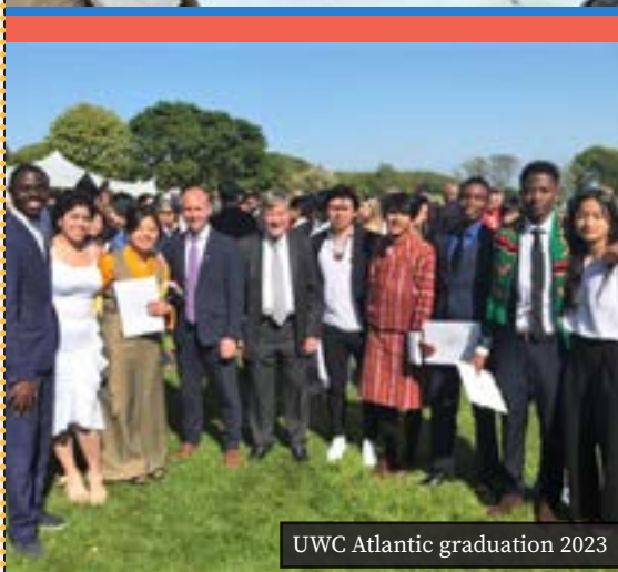
UWC Atlantic graduation 2023